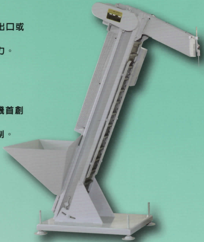
填充式送料機 FILLING FEEDER