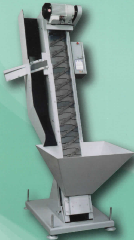
送料整列機 ARRAYING FEEDER